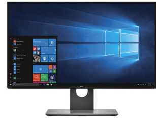
Dell UltraSharp 27 InfinityEdge Monitor – U2717D