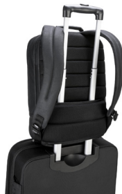
Dell Premier Slim Backpack 14