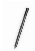
Dell Active Pen – PN557W