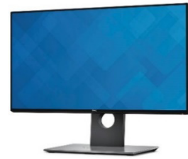
Dell UltraSharp 24 InfinityEdge Monitor – U2417H