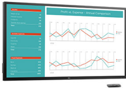
Dell 70 Interactive Conference Room Monitor | C7017T