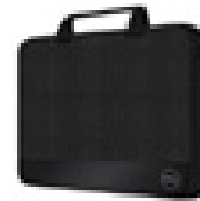
Dell Professional Sleeve 13