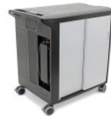
Dell Mobile Computing Carts